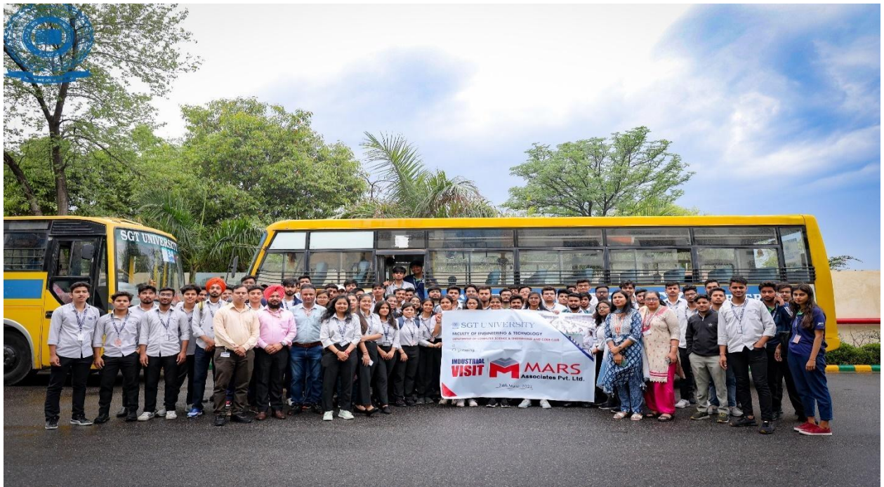
Students starting from SGT University, Haryana