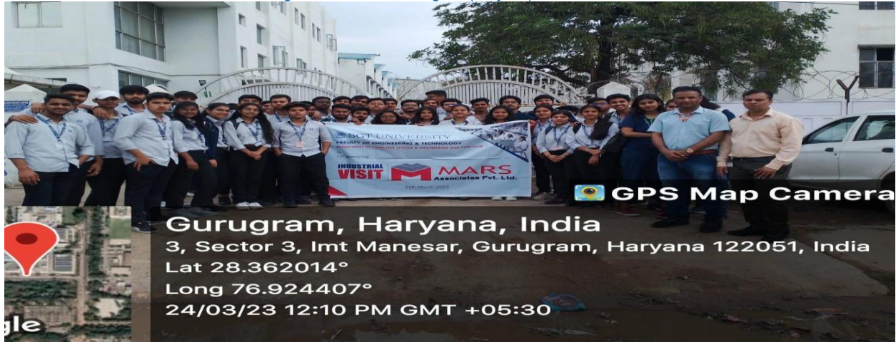
An industrial visit to Mars Associates Private Limited, Gurugram

Budhera, Gurugram-Badli Road, Gurugram (Haryana) – 122505 Ph. : 0124-2278183, 2278184, 2278185