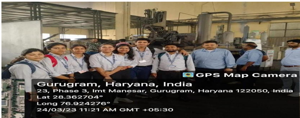
Students were introduced to working of machines