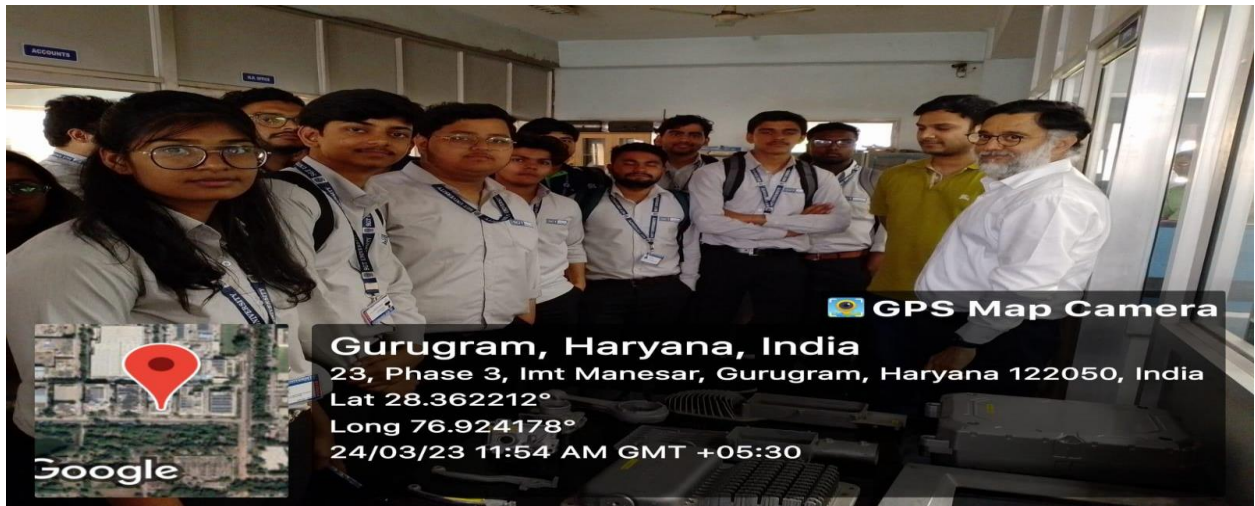
Experts interacting with students at Mars Associates