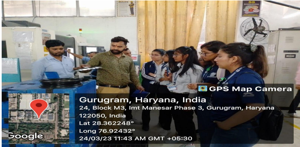
Expert demonstrating working of devices

Budhera, Gurugram-Badli Road, Gurugram (Haryana) – 122505 Ph. : 0124-2278183, 2278184, 2278185